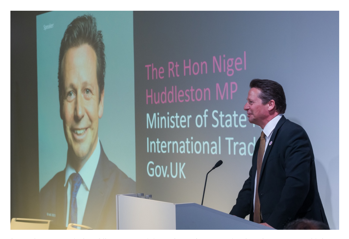
Photo: The Rt Hon Nigel Huddleston MP, Minister of State for International Trade, Gov.UK as Chief Guest delivering his keynote speech