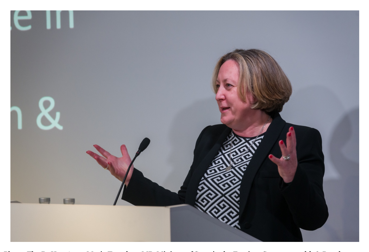
Photo: The Rt Hon Anne-Marie Trevelyan MP, Minister of State in the Foreign, Commonwealth & Development Office, Gov.UK as Chief Guest delivering his keynote speech