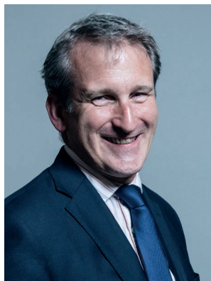
The Rt Hon Damian Hinds MP Secretary of State for Education

The role of governance in our school system cannot be underestimated. Governors and trustees are committed to improving education for our children, whilst fitting this important and essential role around their day-to-day lives. I would like to offer my personal thanks to all those selfless volunteers across the country.